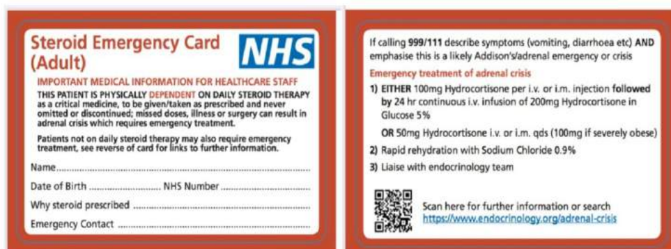
Figure 1: Steroid Emergency Card for patients with adrenal insufficiency issued by the UK National Health Service in March 2020 (downloadable at https://www.endocrinology.org/media/3563/new-nhs-emergency-steroid-card.pdf )